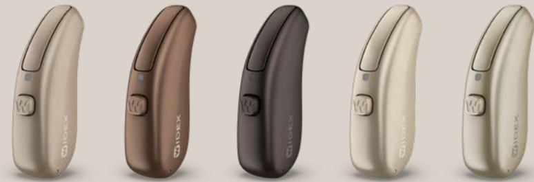
Autumn Beige (123) Chestnut Brown (115) Dark Cherry (116) Golden Brown (120) Honey Blonde (114)