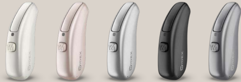
Pearl White (068) Rose Gold (153) Silver Grey (119) Tech Black (118) Titanium Grey (121)